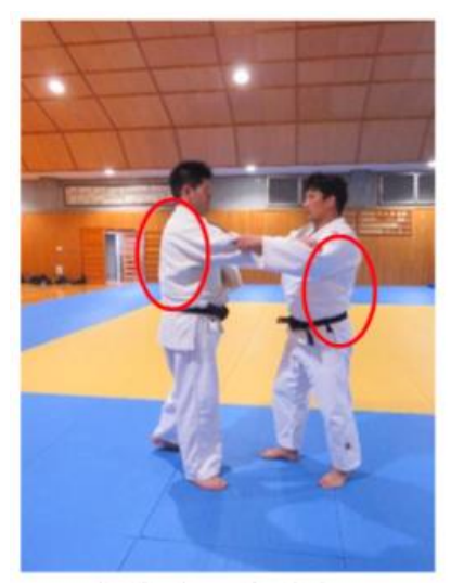
Photograph 1. Square box (Right: Wrestler M; Left: Wrestler S)