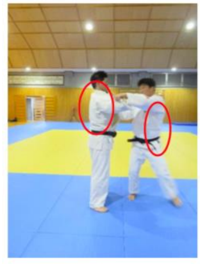
Photograph 2. Diamond box (Right: Wrestler M; Left: Wrestler S)