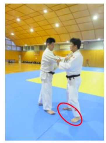
Photograph 4. Rigidity of the inside of the right foot and lifting of the left foot

First, rigidity of the right lower back was obvious in the regular warm-up. As described above, until now it was the tendency of the left heel to lift as a result of the rigidity of the left lower back that had been seen as the problem. Because the left foot is Wrestler M's pivot foot, if the right foot tends to lift this has a major effect on his landing after evading a waza , and this needed to be improved (Photograph 4).