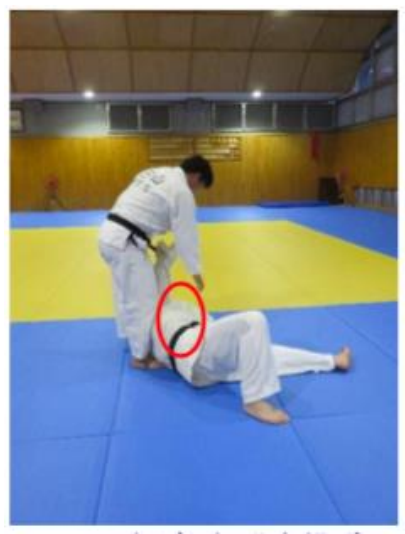
Photograph 3. Seoi-nage (Right: Wrestler S; Left: Wrestler M)

As shown in Photograph 1, when the two wrestlers were grappling in a square box, Wrestler S on the left was exhaling (relaxed), and Wrestler M, who was waiting for the chance to perform a waza, was inhaling (rigid). In the next photograph, when they had moved to a diamond box, Wrestler S on the left had taken a deep breath and his body looked rigid. Wrestler M noticed the moment his opponent drew that deep breath and moved to the waza (seoinage) shown in Photograph 3. That photograph captures the moment at which Wrestler M on the left had fully exhaled and performed the waza successfully, then inhaled and straightened up his upper body, while Wrestler S had yet to exhale after being thrown and was still rigid (indicated by the red lines).