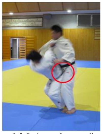
Photograph 5. Seoi-nage when grappling with a taller opponent

Although the term 'maai' is not used in judo, as explained in Footnote i, a glance at the descriptions in Table 1 makes it clear that the 'distance' between the wrestler and his opponent described by Kanō is engraved within the wrestlers when they grapple.